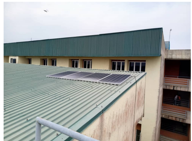
Fig. 3: The installed PVs on the roof of the Admin Block.

Various components were acquired for the project, to fit the design (Table 1). Aluminium profiles were used to install the 4 pieces of 300W PVs on the roof of